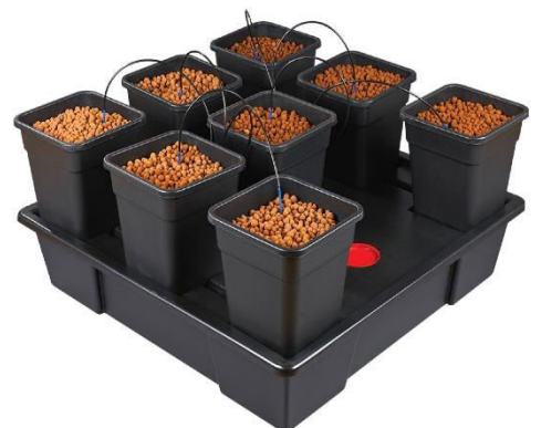
Lead the Cobra hosing to Wilma pots placing in corresponding positions