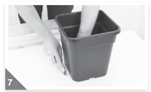
If using potted plants a correx cover is supplied to block light out. If required simply cut out a hole to fit the pot.