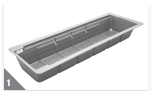
Place the tank (reservoir) in the position that your system will be used. Make sure that the surface is level.