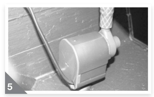
Fit the pump to the pump inlet.