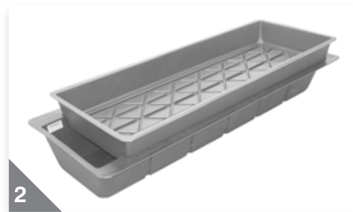
Rest the table on the tank so that the large holes are at the end where access to the tank is easiest.