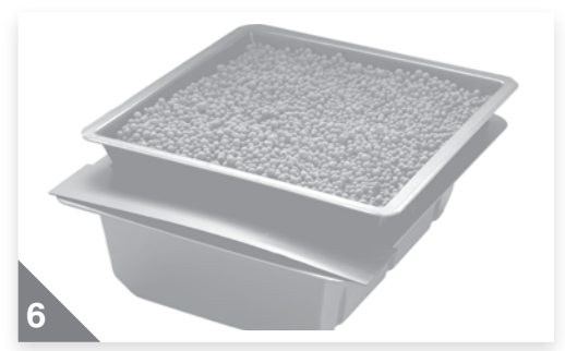
Ebb and Flood can be used with pebbles and bare rooted plants. Space your plants evenly.