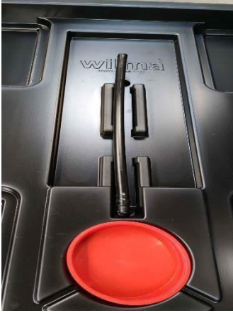
Put the hose on top of it