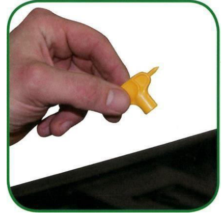
Grab holer puncher