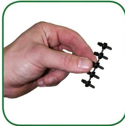
Grab the connection nozzles