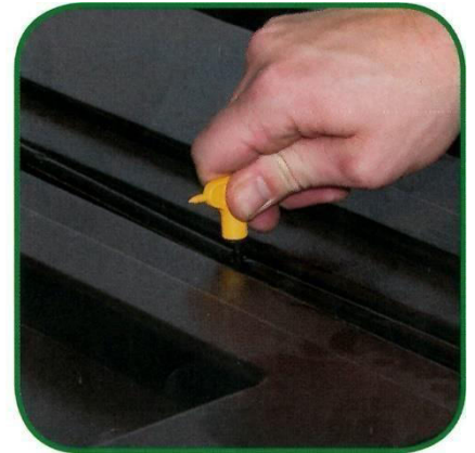
Using the holer puncher fit the connection nozzle into pierced holes