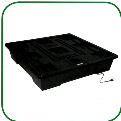
Place Wilma lid on bottom with power cord hanging out