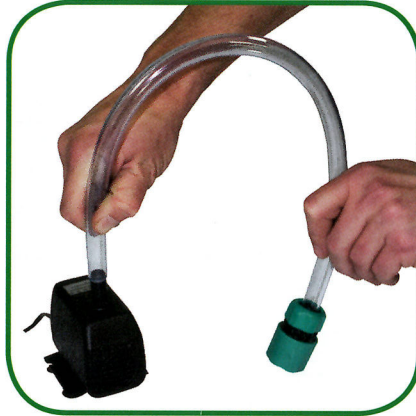
Connect hose to circulation pump