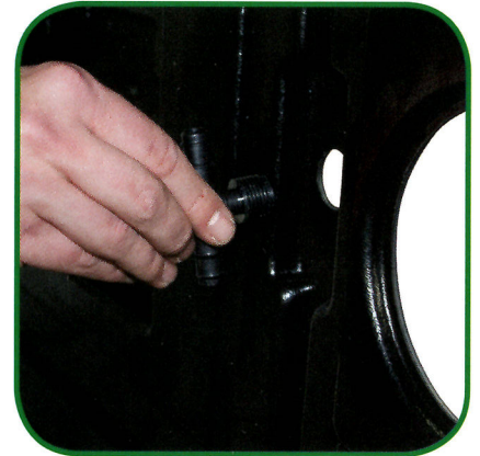
Place tee divider through lid for hose connection