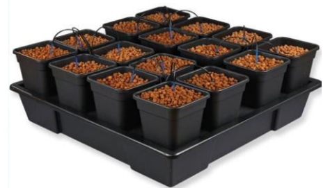
Lead the Cobra hosing to Wilma pots placing in corresponding positions