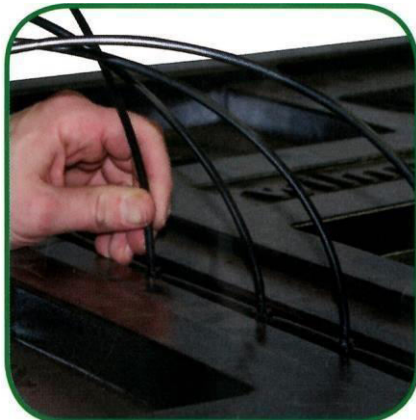
Continue to fit all Cobra hosing to nozzles along the piping