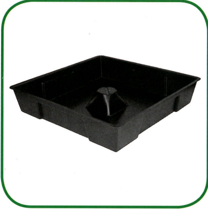
Place Wilma bottom in designated area