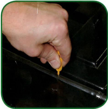
Pierce piping for fitting Cobra hosing in desired position