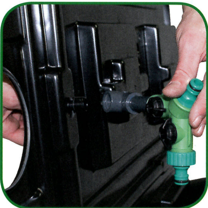
fasten hose connection to tee divider