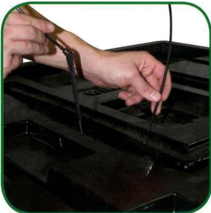
Fit Cobra hosing to nozzles