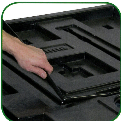
Fit piping to elbow piece