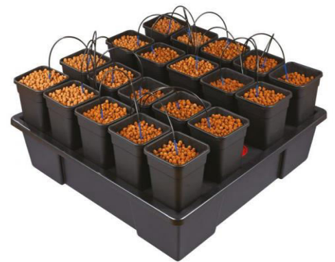
Lead the Cobra hosing to Wilma pots placing in corresponding positions